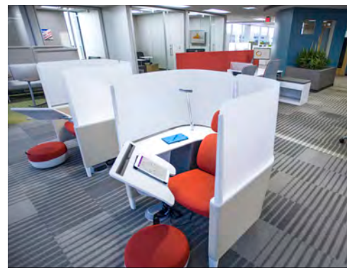
Kelly Anywhere remote workers can find privacy from the open plan with Brody WorkLounge.

To learn more about the visions and values of this leading temporary staffing service visit kellyservices.us