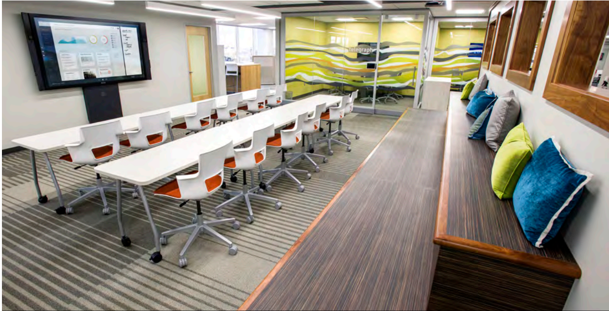
A variety of enclosed and open collaboration spaces are open to all Kelly Services team members. The training room supports flexibility with mobile tables and chairs to create a variety of layouts. The tiered bench along the back provides additional seating and a unique way to listen and learn.

"Kelly Anywhere" remote workers to use when they are on-site make it clear that they are a valued part of the team.