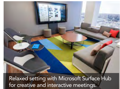
Relaxed setting with Microsoft Surface Hub for creative and interactive meetings.