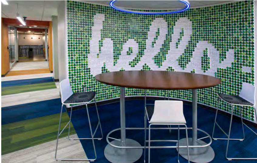
One way Kelly Services incorporated their brand and culture was with a custom "hello" wall mosaic made out of team member photos. This wall makes a statement when you enter the floor.