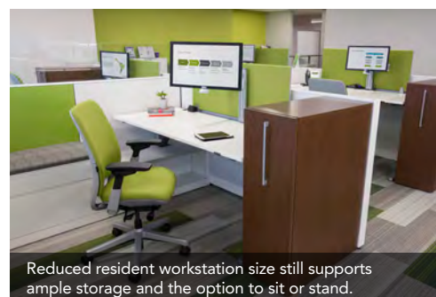
Reduced resident workstation size still supports ample storage and the option to sit or stand.