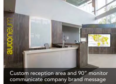
Custom reception area and 90" monitor communicate company brand message