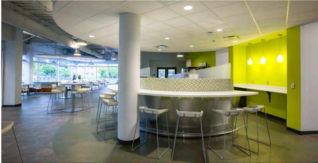
Custom bistro area brings team members together and highlights company brand through color. Standing height offers a chance to change posture.

Then there's the Bistro, with its garage door that signals a welcoming ambiance. These days work happens everywhere. Boundaries between home, work and personal passions are often indistinguishable, which makes the Bistro so appealing. It brings together the best features of a dining room, event space, coffee shop and meeting room—in one place that buzzes with energy. It gets better. Open the garage door to the adjacent training room and you have an expansive gathering hall that can accommodate very large groups. Since collaboration is grounded in human interaction, the Autoneum workspace brings people together in invaluable ways.