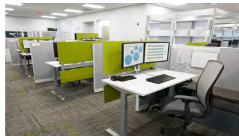
All employees have height adjustable desks to improve wellbeing. Smaller footprint optimizes real estate.

To learn more about this global leader in acoustic and thermal materials used in the automotive industry, visit Autoneum.com .