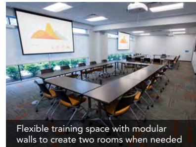
Flexible training space with modular walls to create two rooms when needed