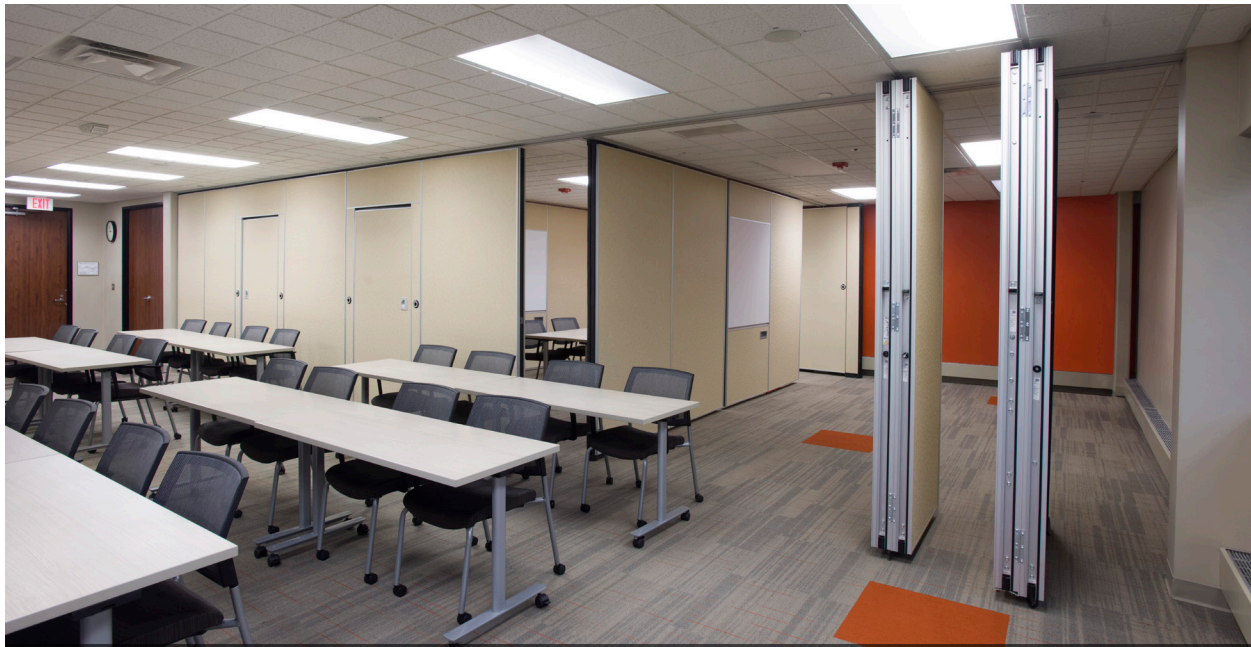
Moderno operable walls support LCG's growing company and need for flexibility. This large training room, dubbed the "playground", can be reconfigured into a variety of small and large spaces for teams to work, collaborate and learn with or without technology.

New value was created in their existing real estate by installing operable walls that provide the flexibility to reconfigure workspaces. These walls move easily to convert an expansive room into smaller, more practical spaces. Alternatively, small adjoining spaces can be combined into a big meeting or training room. Both large gatherings and small group work are enabled by projector presentation and communication technologies, as well as sound masking, installed by NBS Audiovisual Solutions.