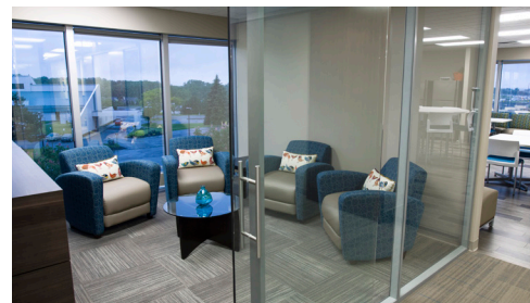
Glass front NxtWall system brings more natural light into the building and provides views to the outside.

More information about this leading childcare and education organization can be found at LearningCareGroup.com