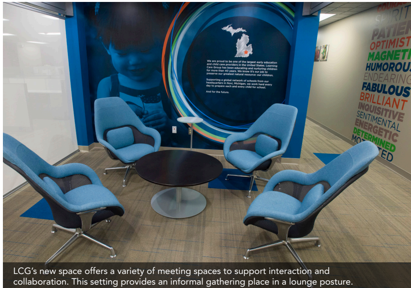
LCG's new space offers a variety of meeting spaces to support interaction and collaboration. This setting provides an informal gathering place in a lounge posture.