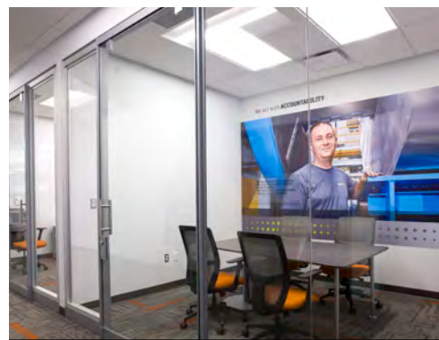
Meeting spaces connect people and information. Custom graphics celebrate company culture.