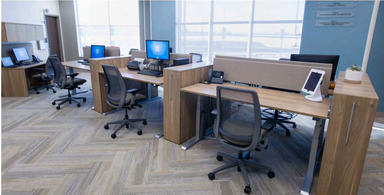
Physician workstations are now freestanding and configured side by side to promote collaboration and optimize real estate. Employee wellbeing is supported with height adjustable desks, access to natural light and pull out storage that can double as a privacy screen.

to offer access to natural light and each other. Each free address station includes a height adjustable desk, ergonomic seating and lockable storage for personal belongings and added privacy when opened. Utilizing shared consultation rooms, physician stations and a common waiting area optimized real estate for this free-standing clinic comprised of three practices. Working diligently NBS completed the project on time, on-budget and with minimum punch work.