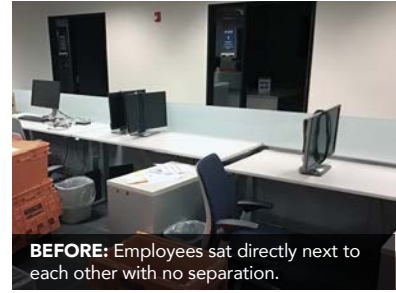
BEFORE: Employees sat directly next to each other with no separation.