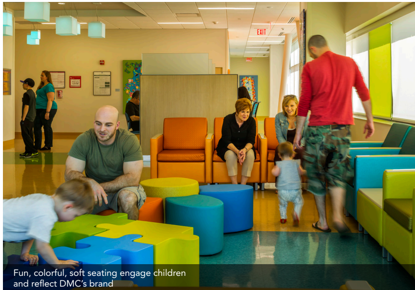
Fun, colorful, soft seating engage children and reflect DMC's brand