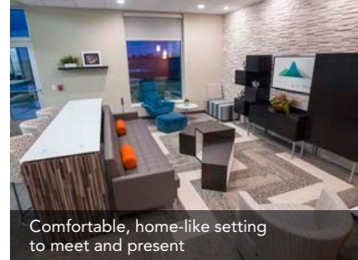
Comfortable, home-like setting to meet and present