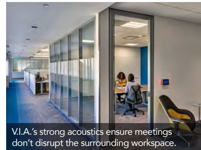
V.I.A.'s strong acoustics ensure meetings don't disrupt the surrounding workspace.