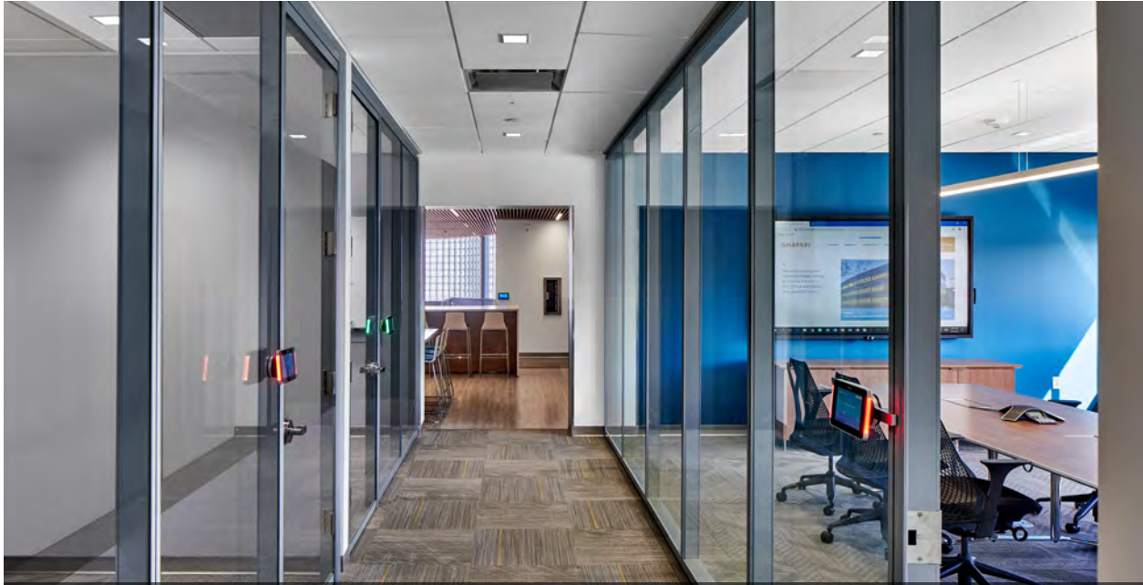
A meeting corridor is lined with V.I.A. glass front rooms ranging in size to accommodate small to large groups. RoomWizard scheduling systems show green or red signaling when the rooms are available or booked. All wiring and data for the system is integrated into the V.I.A. panels.

In addition to developing private meeting spaces with the V.I.A. system, NBS also worked on the look and functionality of the greater second-floor area. Some areas that were drywalled received V.I.A. glass fronts or glass doors to create consistency in the experience of the space.