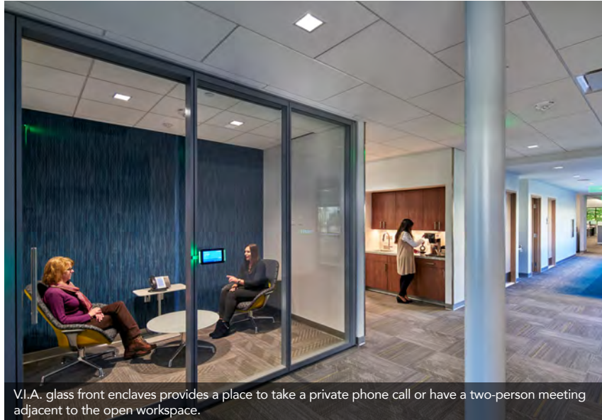
V.I.A. glass front enclaves provides a place to take a private phone call or have a two-person meeting adjacent to the open workspace.