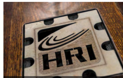
A custom conference room table features a laser cut power access cover with HRI's logo.