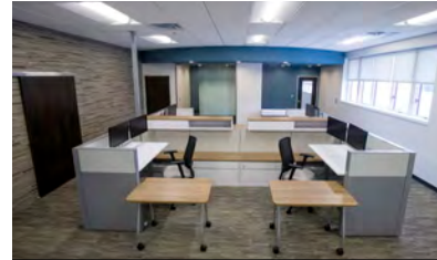
The office space is modern and bright with four workstations and a glass front enclave.