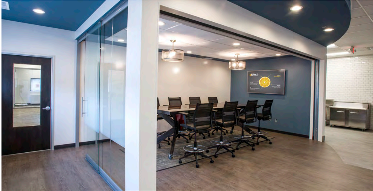
A glass front garage door connects the conference room to the test kitchen. The door can be opened at the push of a button to enlarge the space for events and training. The standing height custom steel and rustic wood conference table engages visitors and employees to collaborate.

Solutions built to add interest and functionality to the space. A glass front conference room, adjacent to the office space, opens onto the demonstration kitchen with a dramatic glass garage door. For added privacy, frosted window film was added at just the right height to block screen content. This room, suitable for both internal and external meetings, also features a custom wood conference table with a unique HRI insignia.