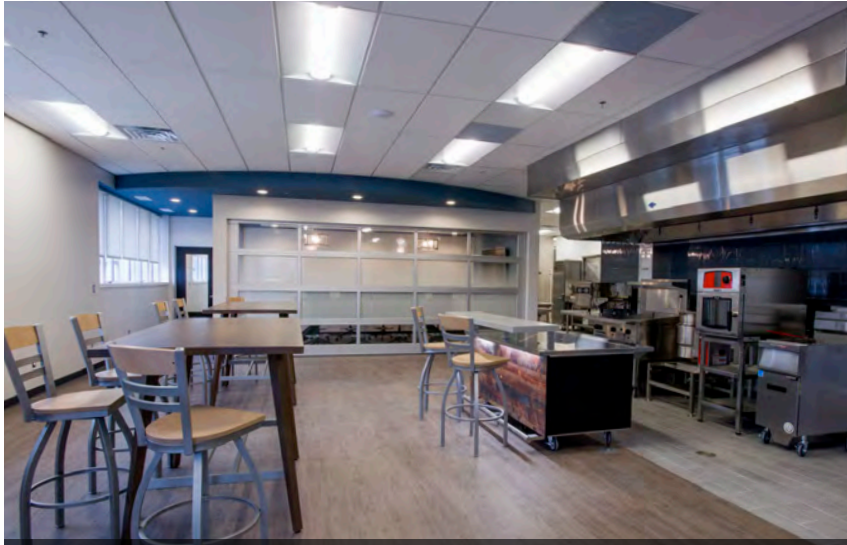
The working test kitchen helps demonstrate and promote HRI's restaurant equipment. The space also acts as a training facility, hosting events and Chef testing.