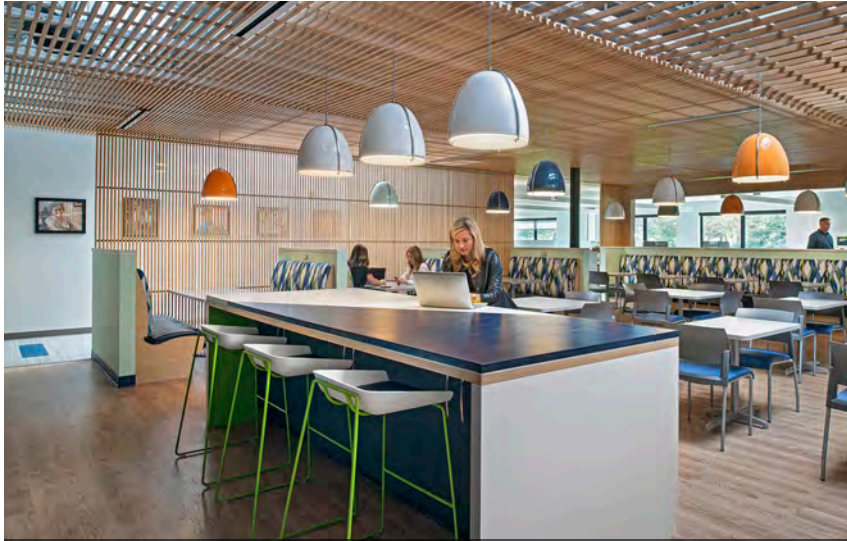
The café is a favorite spot in the building. This multi-purpose space is bursting with color, comfort and efficiency. Not only can workers relax and eat, but also work and have informal meetings.