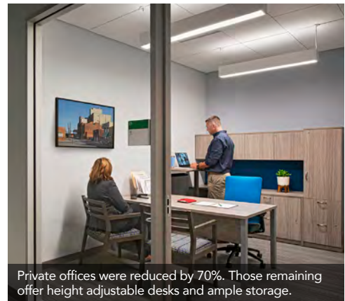
Private offices were reduced by 70%. Those remaining offer height adjustable desks and ample storage.

To learn about MORC and their dedication to human services visit https://www.morcinc.org/