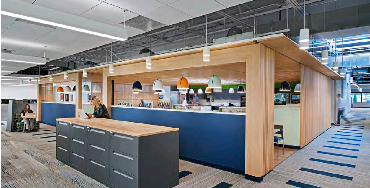
Workers now have increased flexibility and choice in the workplace which has resulted in more face to face interactions and better communication between teams. The variety of spaces promote different postures as well as different levels of focus and collaboration.

height adjustable desks were given to all workers, as well as spaces to support different postures and areas to focus and rejuvenate. These details all work together to create a space that not only looks new, but one that promotes the wellbeing of clients and workers alike.