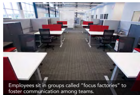
Employees sit in groups called “focus factories” to foster communication among teams.