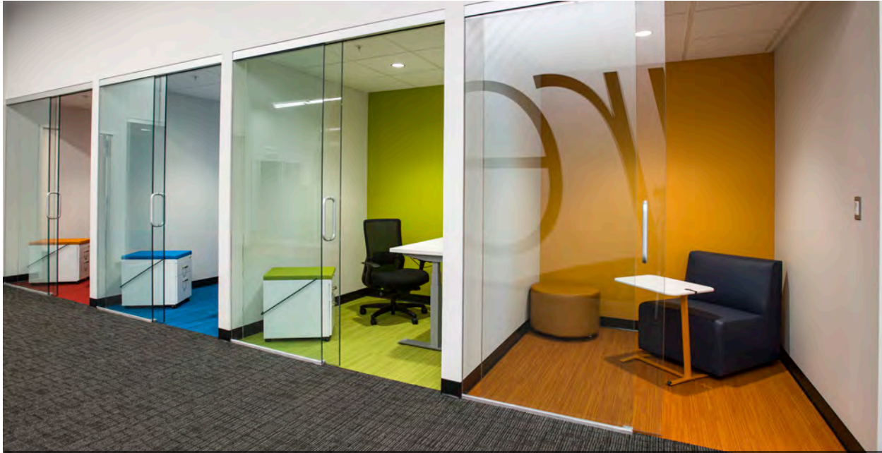
Each end of the building offers glass front focus rooms for workers to break away from their desk to complete heads down work or take a phone call. Pops of fun colors and comfortable supportive furnishings make these rooms inviting and sought after.

Previously, staff members worked at desks with high panels that afforded little to no collaboration. Now, they work in “focus factories” with lower workstation panels that free up space for easier communication. Employees can also jump into focus enclaves when needed. Glass fronts and bright colors make these individualized rooms inviting— some have lounge furniture while others have height adjustable desks depending on the type of focus work needed.