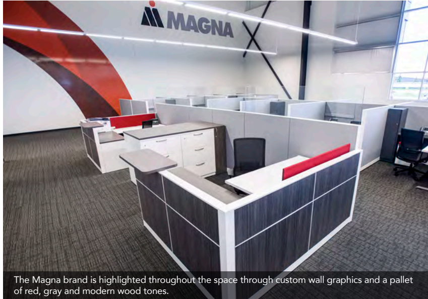
The Magna brand is highlighted throughout the space through custom wall graphics and a pallet of red, gray and modern wood tones.