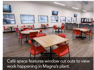
Café space features window cut outs to view work happening in Magna's plant.