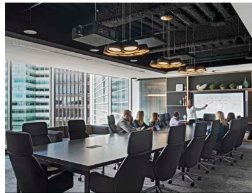
Meetings are productive and engaging with high back seating and clear sight lines to the Surface hub.

NBS is an authorized Microsoft Surface Hub reseller, visit yournbs.com/surface to learn more.