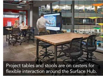
Project tables and stools are on casters for flexible interaction around the Surface Hub.