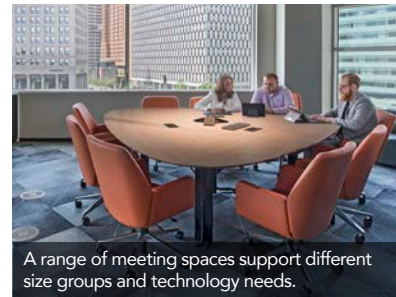
A range of meeting spaces support different size groups and technology needs.