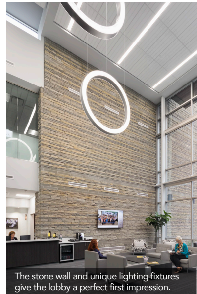
The stone wall and unique lighting fixtures give the lobby a perfect first impression.