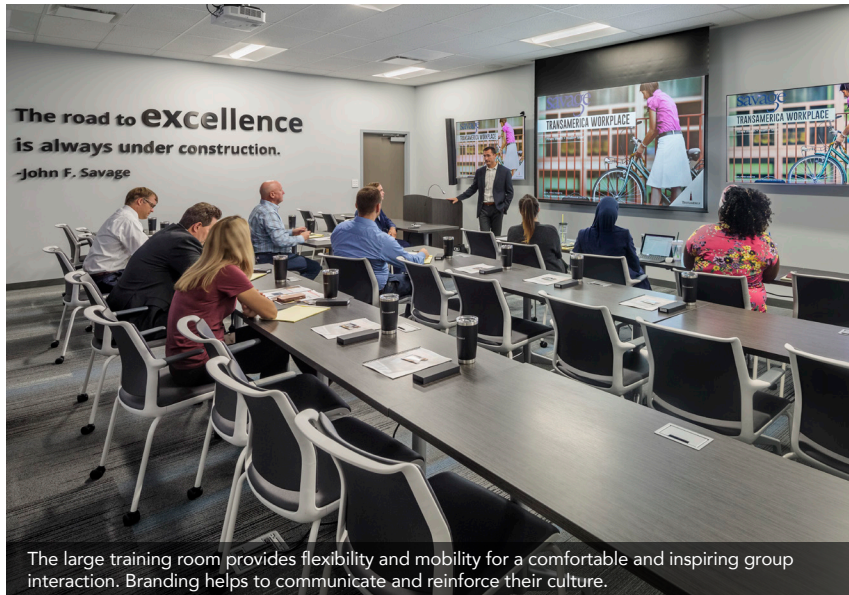
The large training room provides flexibility and mobility for a comfortable and inspiring group interaction. Branding helps to communicate and reinforce their culture.