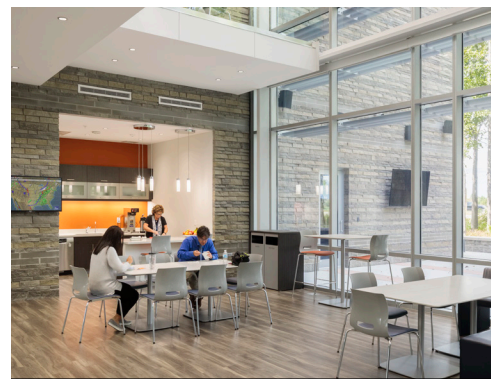
Natural light and a spacious atrium gives the cafe a welcoming sense, allowing for impromptu meetings.

Discover how Savage and Associates can help you plan for the future at savageandassociates.com .