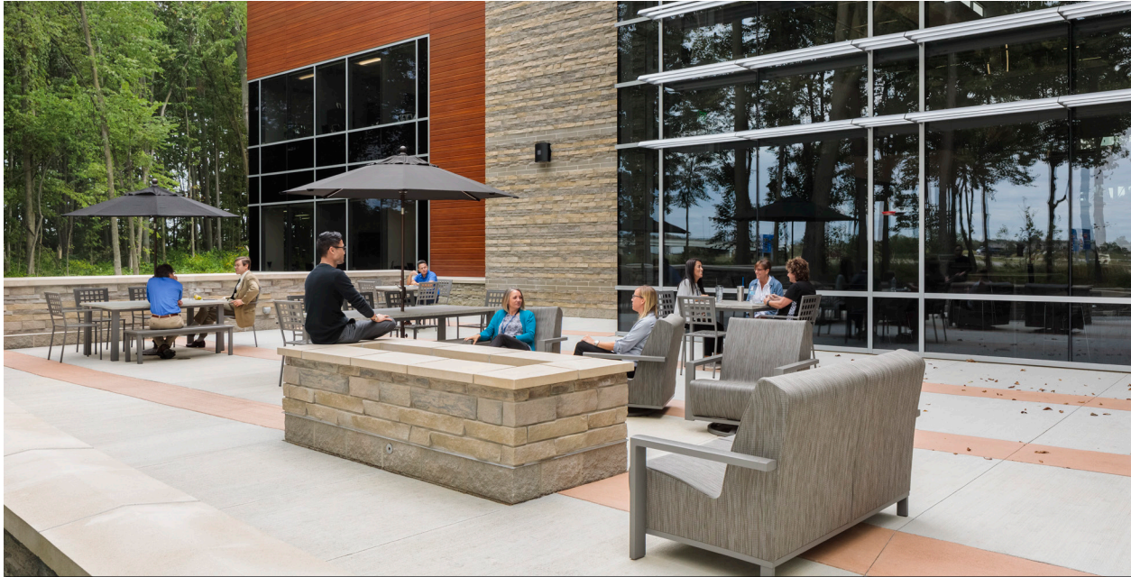
The outdoor patio offers a residential feel and functions as an extension of the main cafe. The relaxing view of nature provides a retreat from the office and serves as a great place to socialize.

necessary amount of enclosed focus spaces and private offices. Prior to the move, advisors could decorate their office to their liking, but now, the space is more unified. NBS curated a selection of furnishings that would allow advisors some freedom to make their offices unique, while promoting a more harmonious look and feel throughout the building. The new design also includes hoteling stations for visiting advisors.