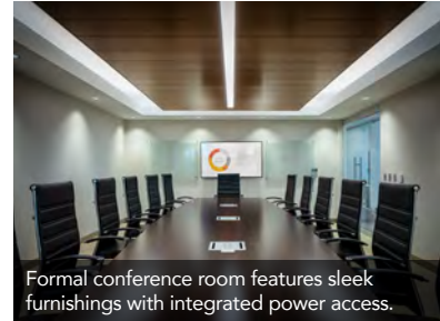
Formal conference room features sleek furnishings with integrated power access.