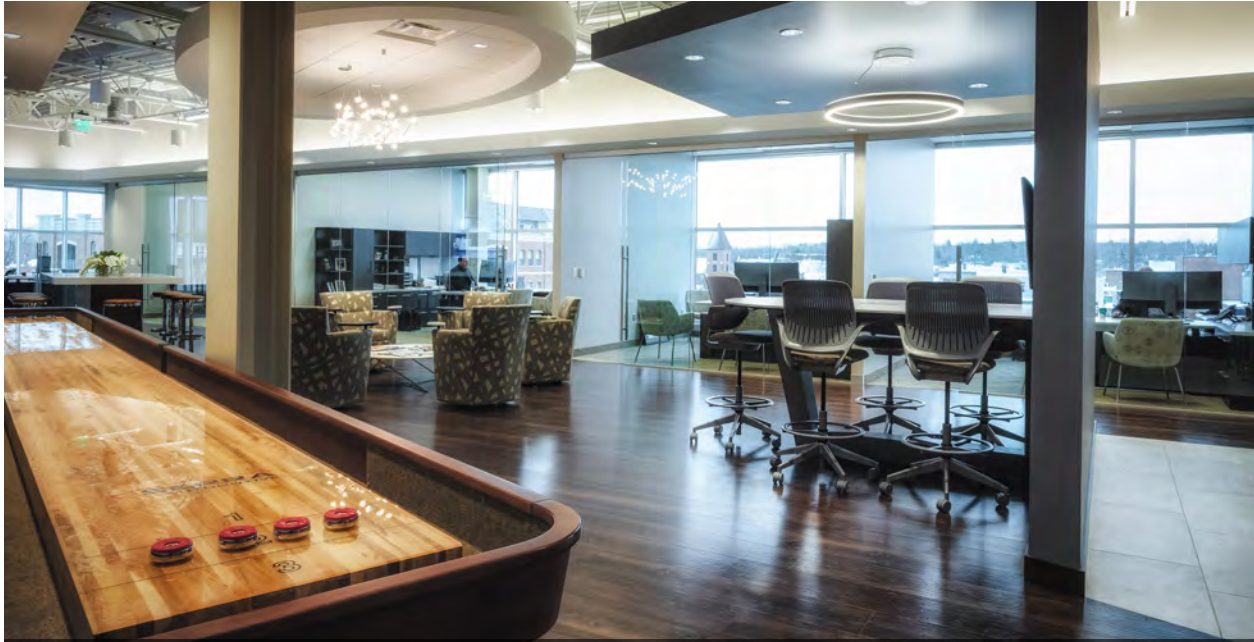
The lounge area promotes team collaboration and socialization. Employees can meet, relax or have some fun on the working shuffle board. Private offices feature glass fronts to let natural light into the space and promote openness and transparency among the company.

NBS took a thoughtful approach designing the private offices at Serra Automotive, and that same attention to detail carries through the collaborative spaces. These spaces offer the same variety of postures for employees, with thoughtful designs that follow the flow of the architectural shape of the building. The lounge area features a custom high-top table next to a wall of monitors. Comfortable lounge furniture with tablet arms create a relaxed environment for team members to work together. For formal meetings, NBS designed a conference room that can seat up to sixteen.