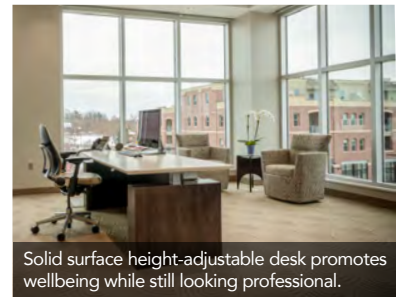
Solid surface height-adjustable desk promotes wellbeing while still looking professional.