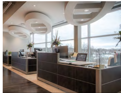
Workstations in the open plan support work tools and offer clear glass to promote connection to the office.

To learn more about this forward thinking retail automotive group visit https://www.serrausa.com