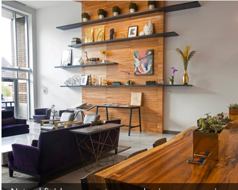
Natural finishes, warm tones and unique accessories create a home-like atmosphere for all to enjoy.

Check out unit floor plans and more photography at TheScottDetroit.com